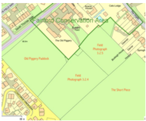
Photograph 3.2.4 Photograph 3.2.5 2 fields between Old Piggery Paddock and The Short Piece