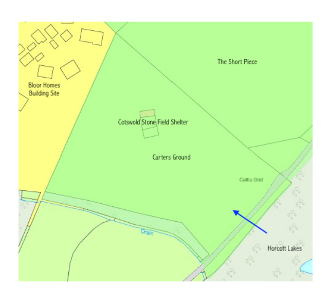
3.3.1 Map showing Carters Ground with The Short Piece to the NE, Bloor developments to the W and Horcott Lakes to the SE

3.3.2 Carters Ground is an old field which contains a historic early C19th Cotswold stone field barn which is proposed as a Non-Designated Heritage Asset (FNP15) due to its archaeological significance. It is used by 7 species of bats<sup>25</sup>. The south east corner of the