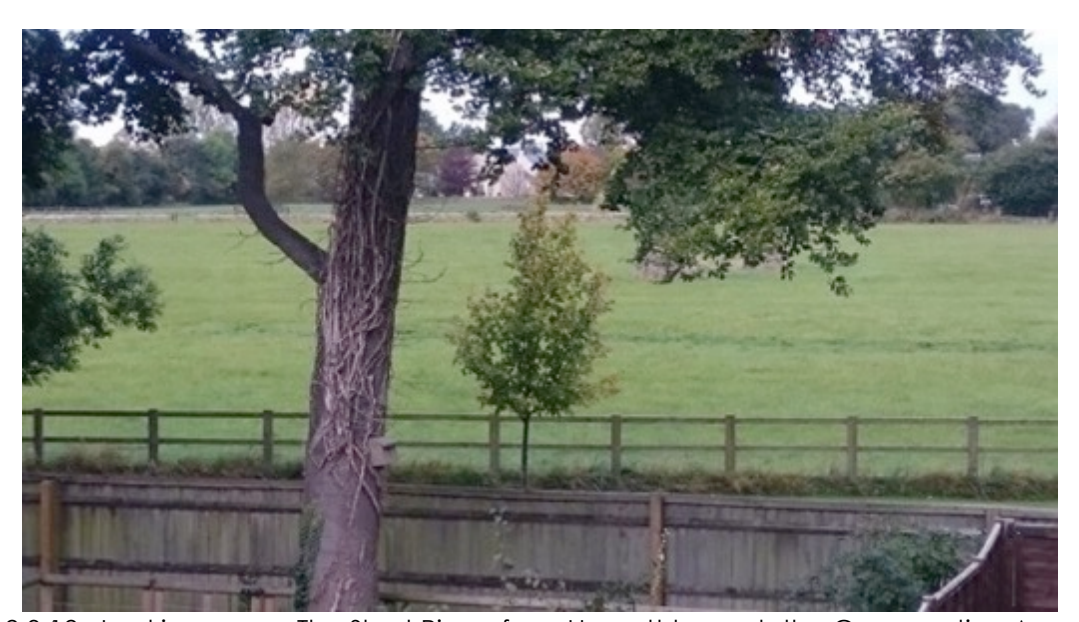
2.3.12 Looking across The Short Piece from Horcott towards the Conservation Area

2.3.13 Is the green space in reasonably close proximity to the community it serves? The green space is surrounded by the local community it serves, ensuring that both settlements, Fairford and Horcott, retain their historic identities and tranquil settings.