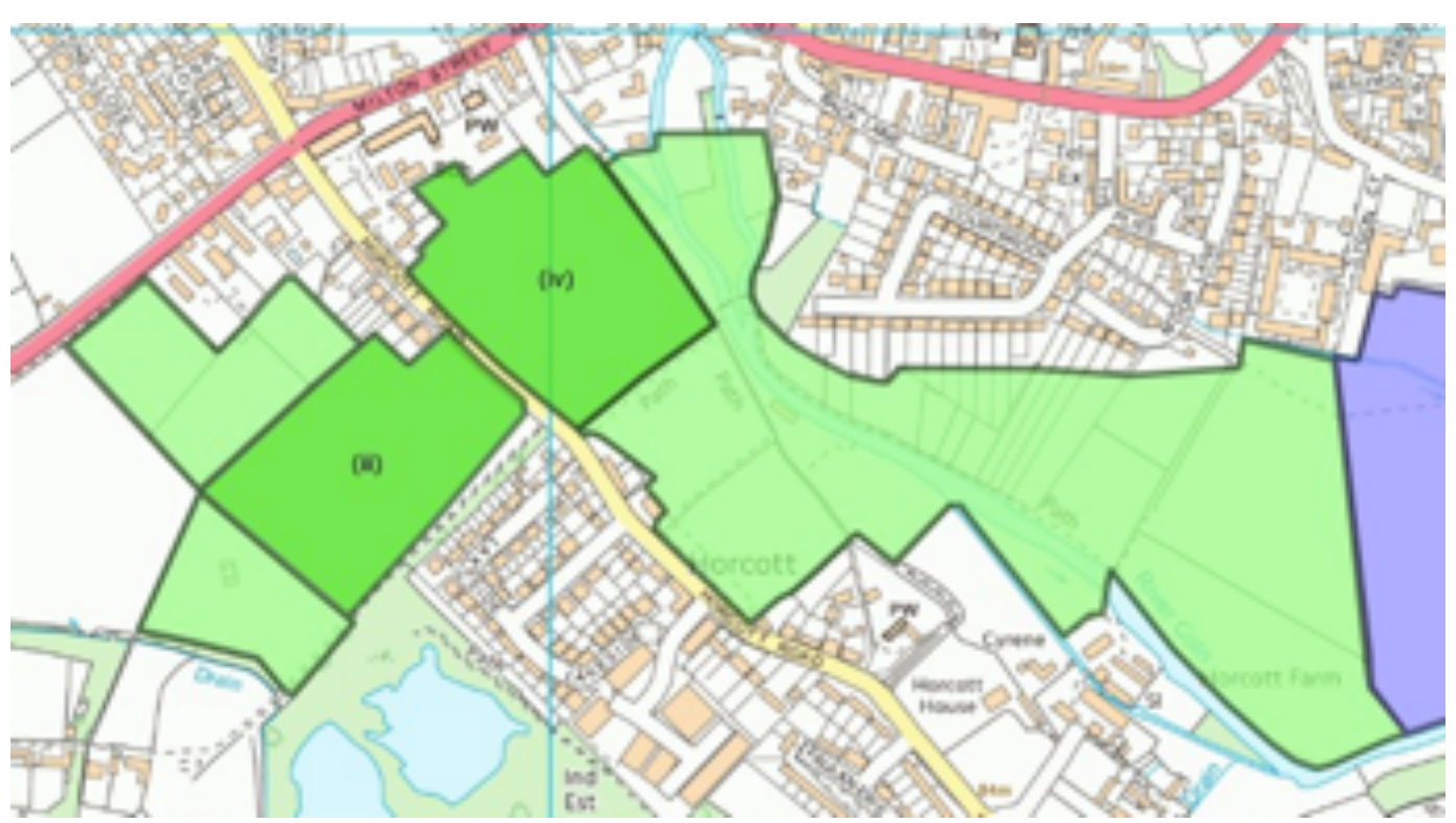
The Fairford – Horcott Local Gap – Policies Map 3.7.6