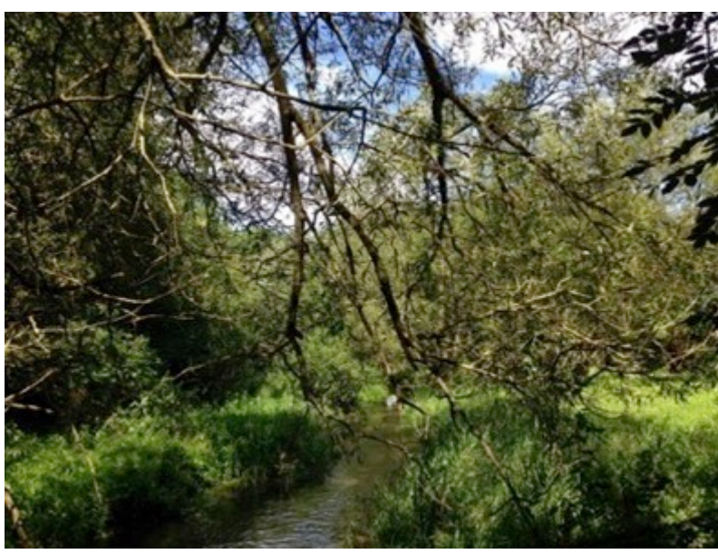
1.2. 8 River Coln