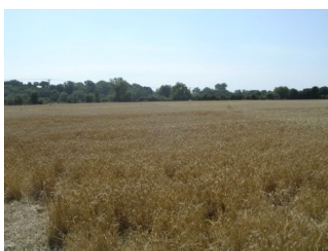
4.1.10 Towards The Home Ground from Fieldway 4.1.11 Towards Morgans Ground from Fieldway