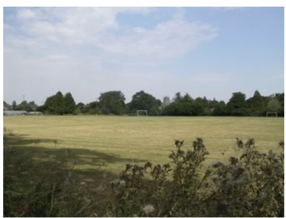
2.4.10 Coln House Playing Field taken from Horcott Road

2.4.11 Is the green space in reasonably close proximity to the community it serves? This site lies between the western half of the town and Horcott. Crucially, it links the open space of The Short Piece with the River Coln and ensures that the separation of settlements continues across the Horcott Road.