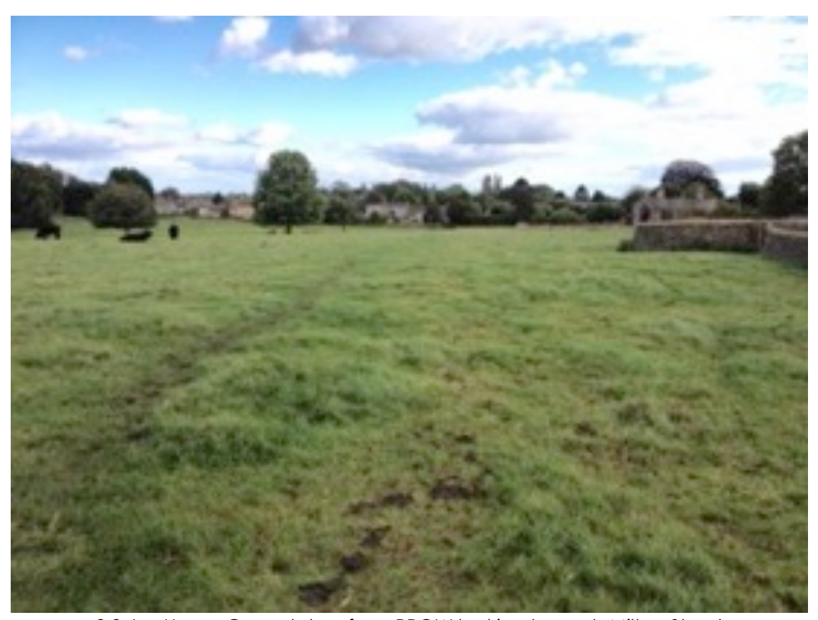
2.2.6 Upper Green taken from PROW looking towards Milton Street

2.2.7 Is the green space in reasonably close proximity to the community it serves? Upper Green is close to both the Town Bridge and Mill Bridge. The Green is at the centre of the town.