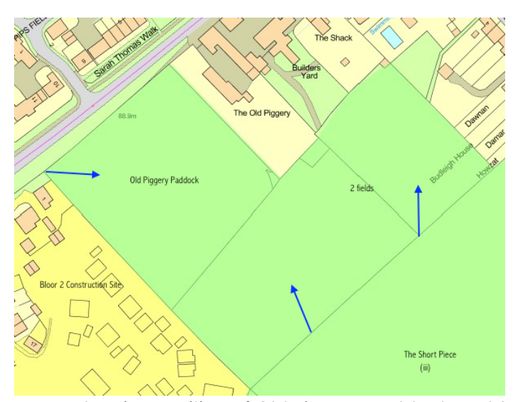
3.1.1 Map showing position of Old Piggery Paddock and 2 fields