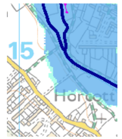
3.6.1 Map showing location of F&LYFC