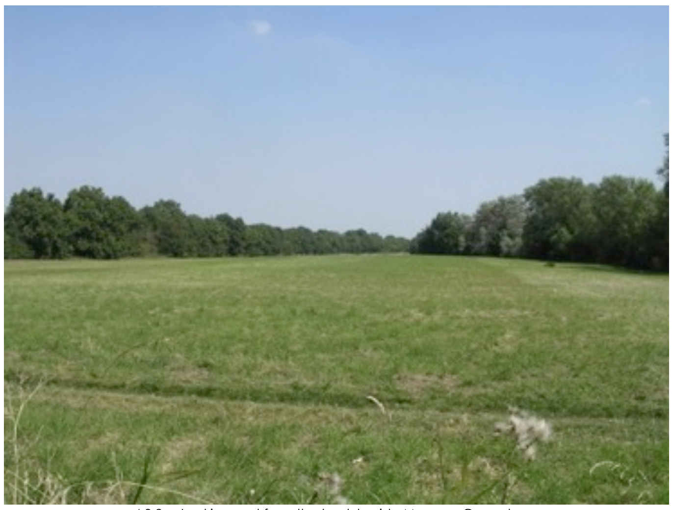
4.3.9 Looking east from the track beside Morgans Ground. The trees to the south mark the edge of Lake 104.