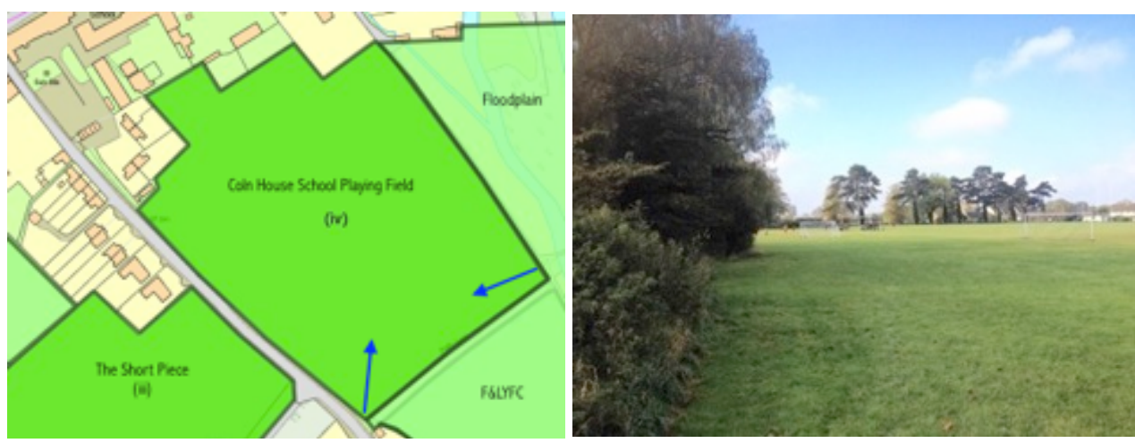
2.4.1 Map showing location of Coln House Playing Field