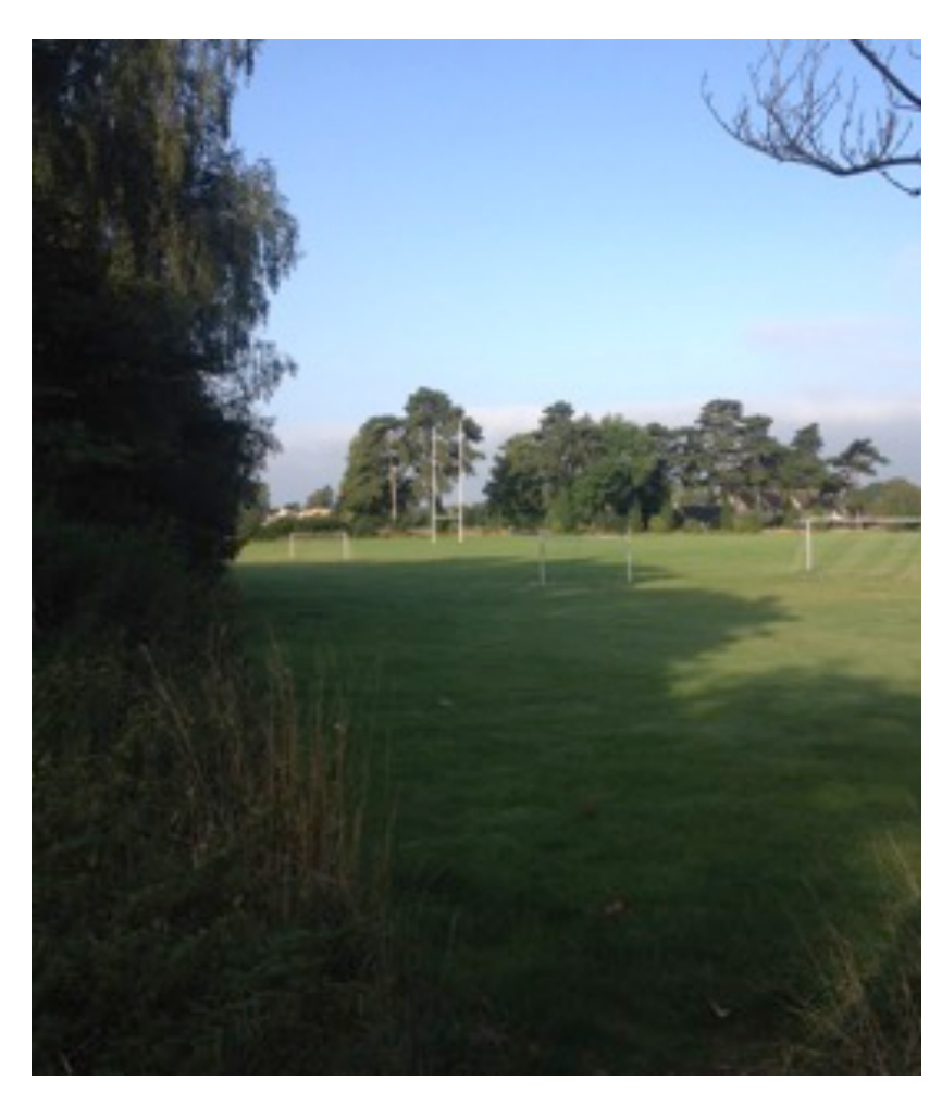
3.5.1 Coln House Playing Field photograph taken from Dilly's Bridge corner.