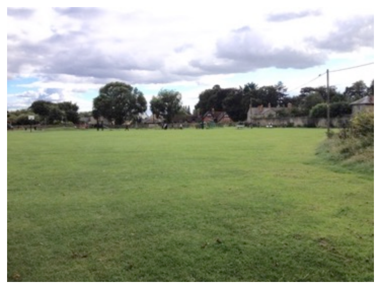
2.1.4 Walnut Tree Field from Park Street looking towards Fairford Cottage Hospital