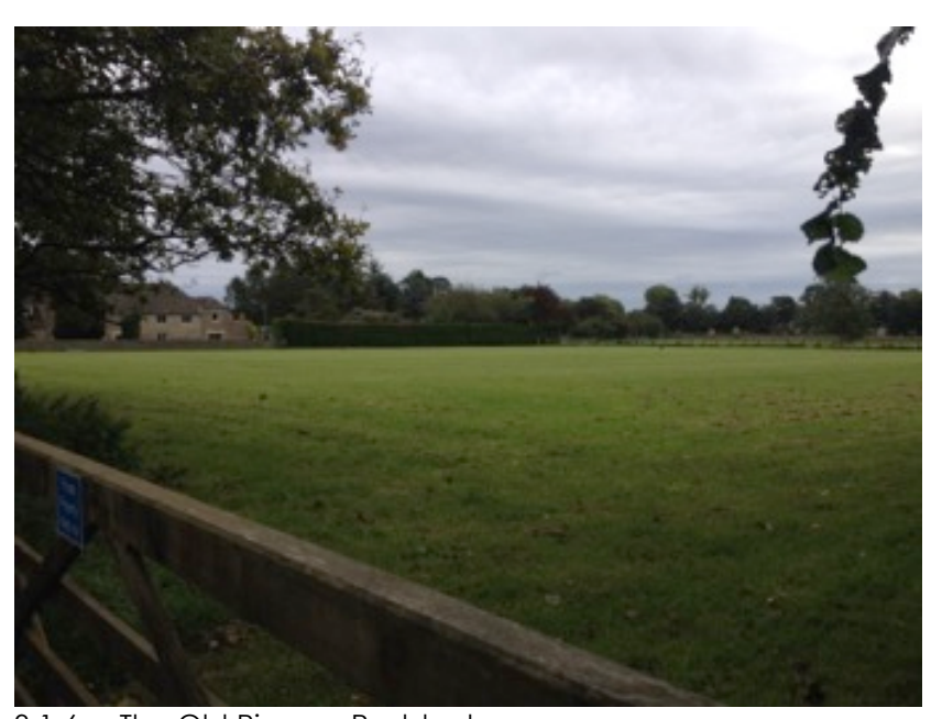
3.1.6 The Old Piggery Paddock