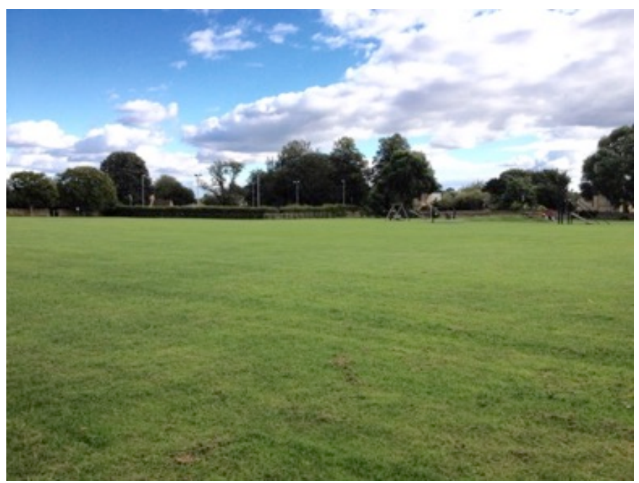
2.1.5 Walnut Tree Field from Park Street looking towards the Tennis Courts

2.1.6 Is the green space in reasonably close proximity to the community it serves? This site is the 'green lung' of Fairford as it is right at the heart of the town, on the way home from school for many, and well supplied with play and exercise equipment.