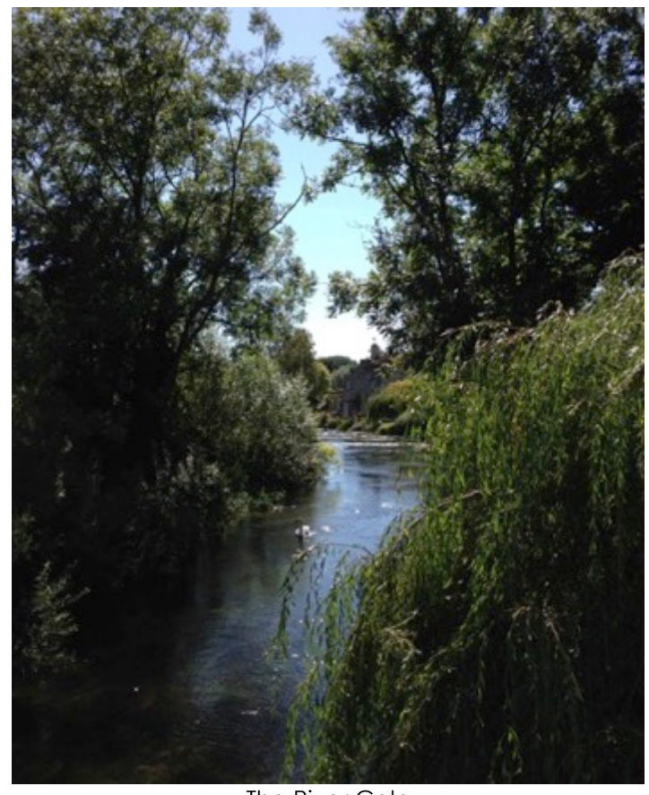
The River Coln